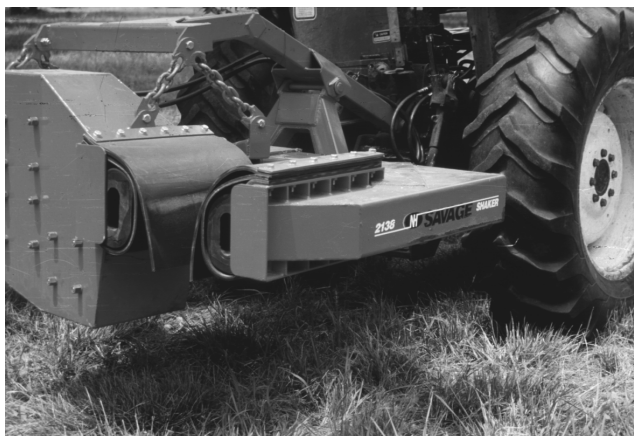
Figure 2. A Pecan Shaker Equipped with Donut Pads.

Nut thinning can be accomplished with a conventional tree shaker equipped with donut pads (Figure 2). Donut pads are essential in preventing injury to the tree trunk. As an additional precaution, apply a coating of grease between the rubber flap and the donut pad. This allows movement at that point and prevents movement of the bark during tree shaking.